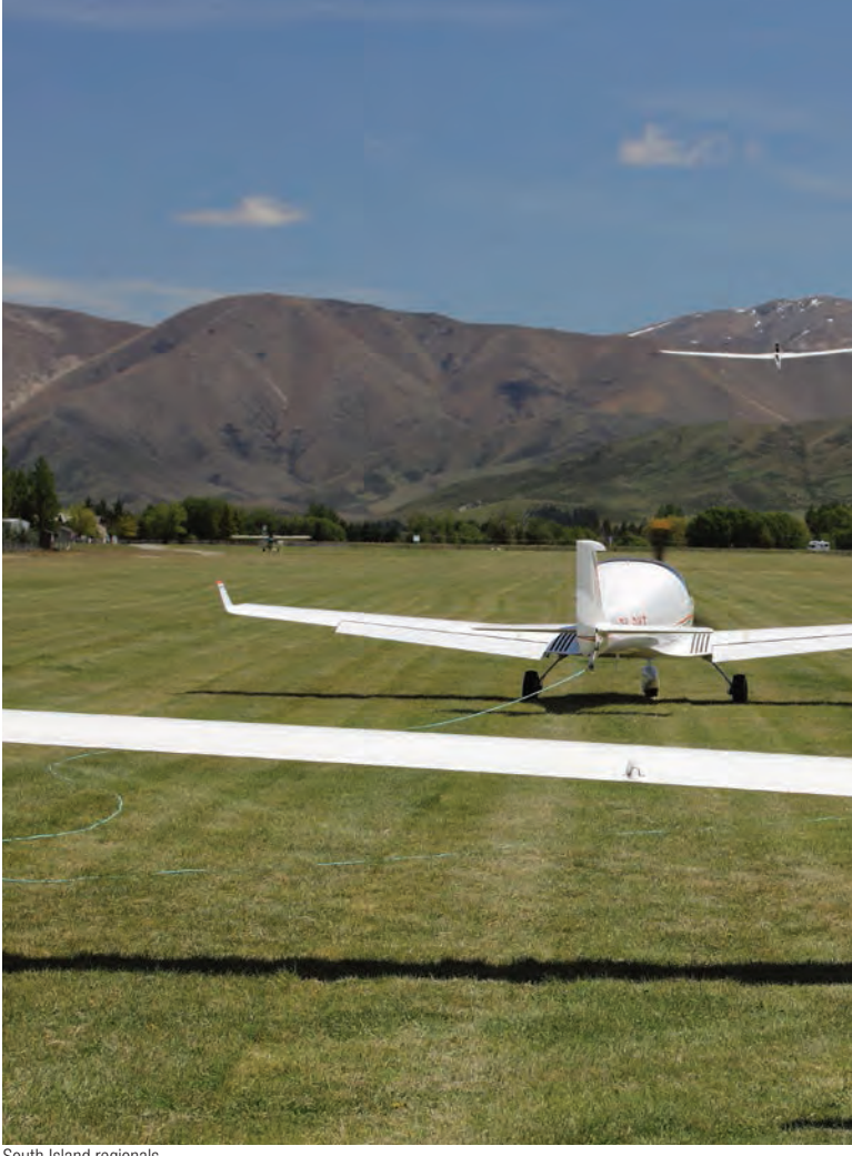
South Island regionals

We've had quite a bit of success too. We have given a lot of kids a chance to learn to fly while at the same time providing safe adult interactions, role models, mentors and heroes to emulate, discipline and self-discipline and a belief in themselves and their ability to do anything they set their minds to. Glider training, simply put, is a great thing for kids to do. I've seen it with my own kids and with other kids within the Youth Glide community. Learning to fly gliders is a really big deal and they are so proud of being able to do something that most of their peers only dream of. Some of our Youth Glide kids have various learning disabilities but they can all learn to fly. The boost to their self-esteem is amazing and on-going. As well as that, we've seen school work improve because physics, maths and sciences actually mean something and are seen to have applications in their lives.