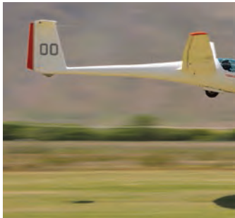
Pete Chadwick on tow