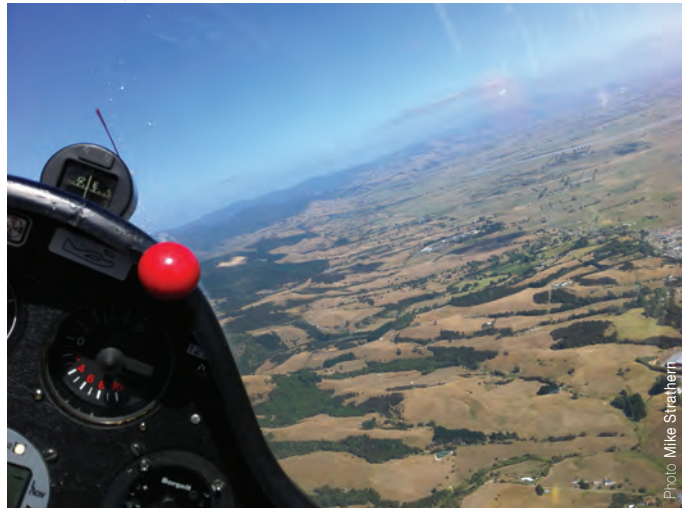
Mlke Strathern at Thames, about to turn back to Taupo